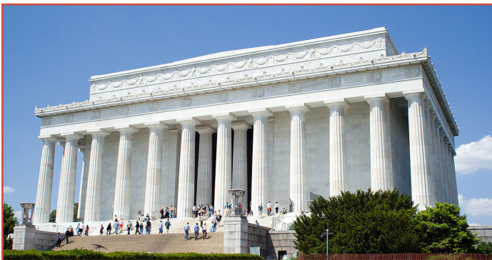
Reason Rally 2016 June 4, 2016, Lincoln Memorial, Washington D.C.

Last fall I asked our members to contribute their time and energy, and got them, in spades: Our dynamic newsletter and Web site redesigns have drawn increased attention, commitment, and new members. In November/December's sermon, I pointed out the enormous importance of the single-issue (Separation of Church and State) 2016 voter campaign for NYCA. Now that the primaries are almost over and the conventions are coming up, we have a crucial role to play in mapping out our future and the future of the entire country.