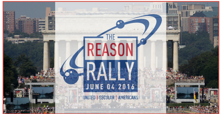
Reason Rally, June 4, 2016