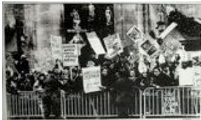
Act-Up Demonstration at St. Patrick's Cathedral

Here's what I found out: There's a saying that those in power will not make changes unless they are forced to. Not until the underdogs, the oppressed, the exploited or the persecuted create such a stir that it is less trouble to give in a little than to cope with the ruckus--only then do most changes take place in our society.