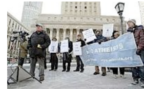
NYC Atheists Miracle Cross Demonstration

When we demonstrated in Foley Square in the "Miracle Cross" case, it was bitter cold and we froze even in our down coats. When we rallied in Washington D.C. at the Reason Rally, we got soaked by the rain. In Foley Square, we had to ignore the taunts of a religious person who shouted that we would all go to hell. When we picketed the Pope in 1995, the cops made us stay behind barricades.