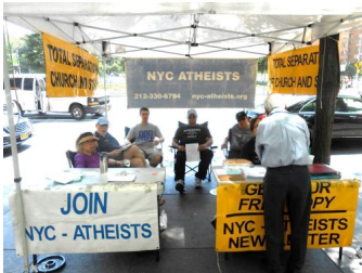
NYC Atheists Street Tabling

NYC Atheists is the only Atheist group in town that does street tabling currently and, let me tell you, it is an education. The whole world passes by our yellow tent on those warm Saturdays that we are tabling on Columbus Circle. Our members--and we have our street tabling "regulars," those who like to engage with the public--have met people from all over the world, from all walks of life, from all religions. I've been doing street tabling every summer now for some nine years, and over the years I've heard every question, every taunt, every justification for religion known to mankind.