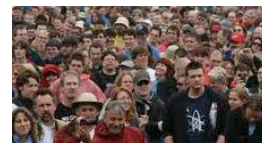
Reason Rally – Washington D.C.

How, you may well ask, can one person impact on making it a better world? If you can say, when Atheist history is made, "I was there. I contributed," then you have made an impact. Were you at the Reason Rally? Good. You can say, "I was there. I contributed." Did you lobby with the 300 Atheists led by the Secular Coalition in Washington? Good. You can say, "I was there. I contributed!" Did you sing a song, write a paper, inscribe a placard? You were there. You contributed! You will be counted when history affirms us.