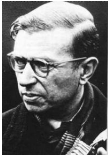
JEAN-PAUL SARTRE JUNE 21, 1905 – APRIL 19, 1980