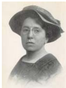
EMMA GOLDMAN JUNE 27, 1869 – MAY 14, 1940