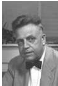
ALFRED KINSEY JUNE 23, 1894 – AUGUST 25, 1956