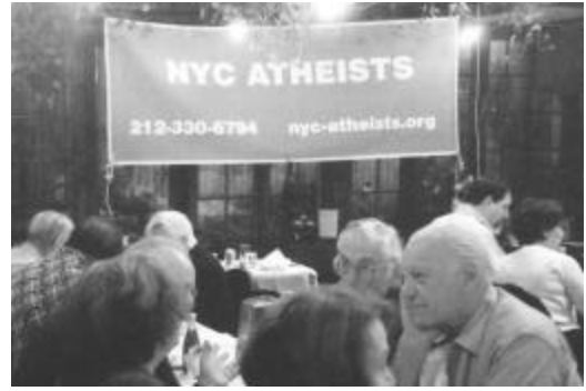
March 12, 2006 NYCA Brunch