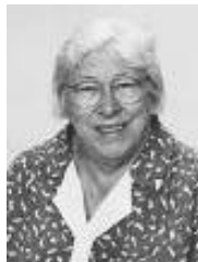
Madalyn Murray O'Hair Quotes April 13, 1919 - 1995

“Without religion, we would have landed on the moon 500 years earlier.”