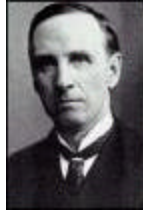
John Morley (1838-1923)