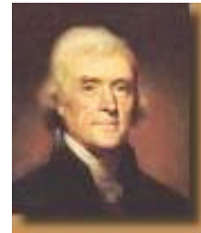
Thomas Jefferson Born Apr. 13, 1743 (same birthday as Ms. O'Hair) US Founding Father

“An Atheist thinks that he can get no help through prayer but that he must find in himself the inner conviction and strength to meet life, to grapple with it, to subdue it and enjoy it.”