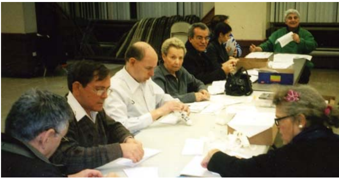
NYCA Members stuffing newsletter envelopes before the Feb. 2, 2006 Movie Nite