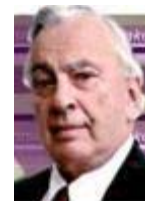
GORE VIDAL "I AM A BORN-AGAIN ATHEIST."

"I once wanted to become an atheist but I gave up . . . they have no holidays."