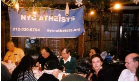
NYCA SUNDAY BRUNCH JANUARY 8, 2006