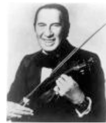
HENRY YOUNGMAN - COMIC 1906-1998