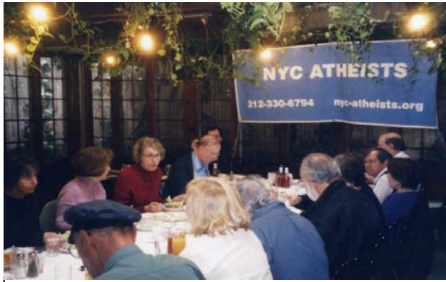
NYCA BRUNCH – SEPT. 11, 2005