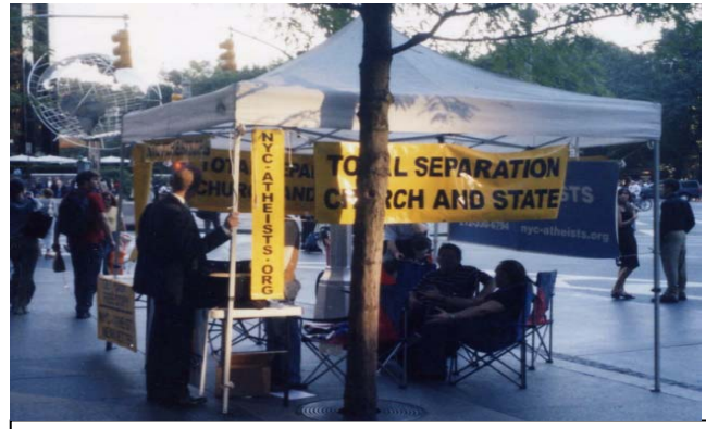
NYCA STREET TABLING SEPTEMBER 17, 2005