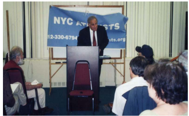
NYCA MONTHLY MEETING SEPTEMBER 29, 2005