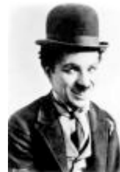
Sir Charles Spencer "Charlie" Chaplin, Britishborn actor, director, and producer, 1889-1977.

"Christianity is the most perverted system that ever shone on man."