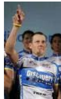
Lance Armstrong – Cyclist