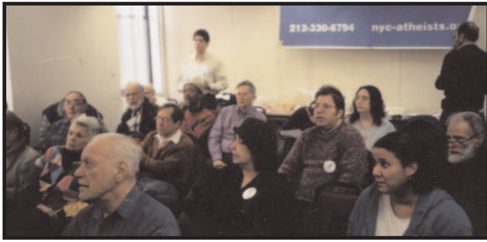
Recent Monthly Meeting