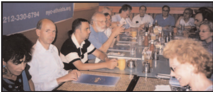
Recent Second Sunday of the Month Brunches