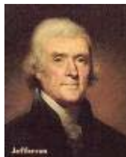
Thomas Jefferson, 1743-1826

"What we're trying to do is figure out how important it may be to better integrate intangible human capacities into high-tech health care," he added. "We definitely think there are important reasons to believe that what a community does at a distance or what a loved one does at the bedside prior to a procedure may belong in the systematic armamentarium of high-tech medical care."