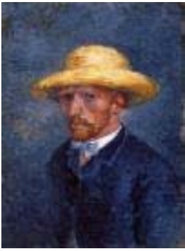
Vincent Van Gogh – 1853-1890 Dutch painter

"I can very well do without God both in my life and in my painting, but I cannot, suffering as I am, do without something which is greater than I am, which is my life, the power to create."