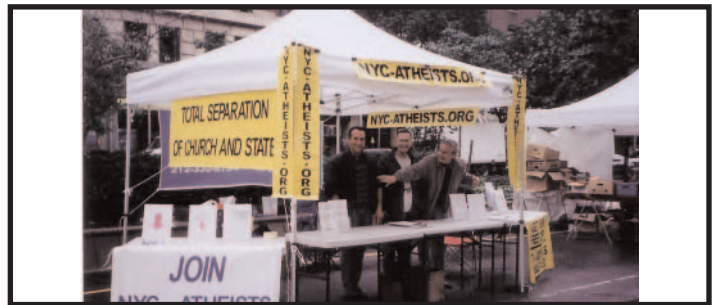
Recent Street Tabling Event