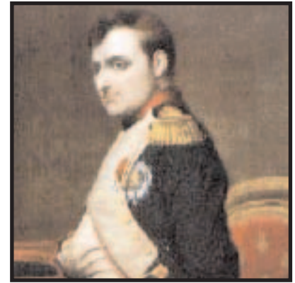
Napoleon Bonaparte, French emperor

Free will is the philosophical doctrine that our choices are, ultimately, “up to us.” Consequently, an unfree action must be somehow “up to” something else. The phrase “up to us” is vague and, just like free will itself, admits of a variety of interpretations. Determinism holds that each state of affairs is necessitated (determined) by the states of affairs that preceded it. Indeterminism holds that determinism is false, and that there are events which are not entirely determined by previous states of affairs. The idea of determinism is sometimes illustrated by the story of Laplace’s demon, who knows all the facts about the past and present and all the natural laws that govern our world, and uses this knowledge to foresee the future, down to every detail. Some philosophers hold that determinism is at odds with free will, a doctrine known as incompatibilism.