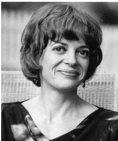
Natalie Angier American journalist

Whatever else I might have thought of [President George W.] Bush's call, with its assumption that prayer is some sort of miracle Vicks VapoRub for the national