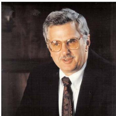
Bruce Alberts-President National Academy of Sciences

From now on — we should always state: when referring/discussing god to say the theory of god .