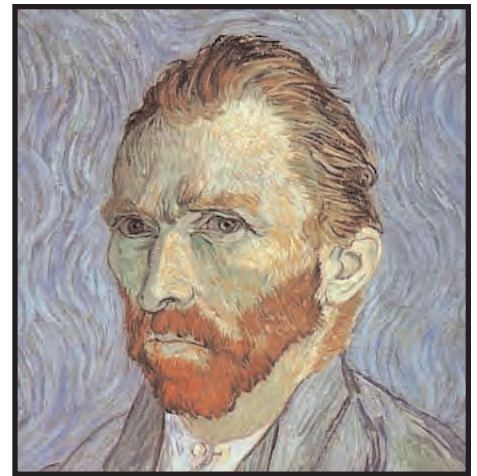
VINCENT VAN GOGH, DUTCH PAINTER

But that's not to say that managing an atheist society is straightforward. Even in a group of nonbelievers, there will always be room for a little doubt.