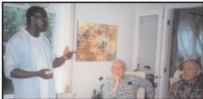
July 4 — Barbecue