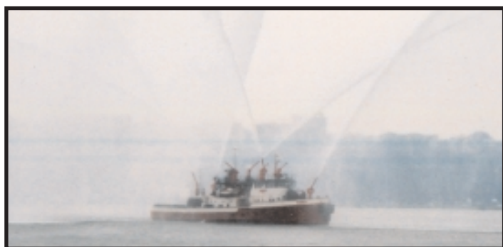
July 18 — Harbor Cruise

Members of NYC Atheists ready to depart for Harbor Cruise and Picnic.