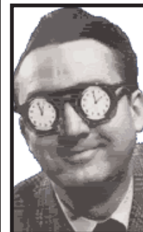
STEVE ALLEN COMEDIAN, ATHEIST

I have been an Atheist since the age of seven. I grew up in a household with a Jewish mother and a Christian father. Neither of them wanted to upset my grandparents by choosing one religion over another, so they chose to raise my brother and me without any religion. I do not think I was ever very religious. On January 28, 1986, the NASA Challenger exploded. I was very upset that night. I was still trying to grasp how such a horrible thing could have happened to the astronauts. Then President Reagan came on TV and at the end of his speech, he used the word God. His use of the word God made me realize that I could not believe in a being that would kill all those innocent people. I refused to believe that an all-powerful God would use his powers for such a horrible act. From that day forward, I refused to buy into religion.