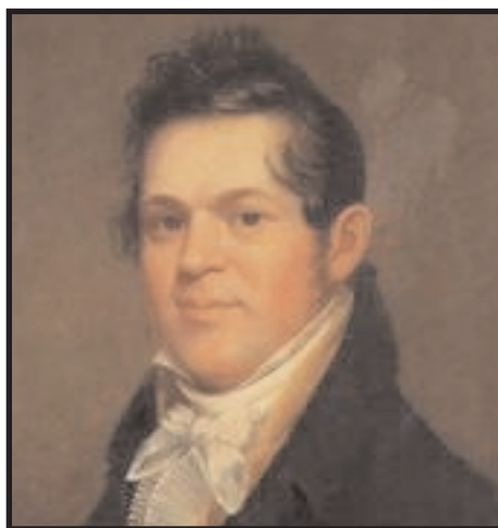
Ethan Allen (1738-1789) American Revolutionary

“I am an atheist, out and out. It took me a long time to say it. I’ve been an atheist for years and years, but somehow I felt it was intellectually unrespectable to say that one is an atheist, because it assumed knowledge that one didn’t have. Somehow it was better to say one was a humanist or agnostic. I don’t have the evidence to prove that God doesn’t exist, but I so strongly suspect that he doesn’t that I don’t want to waste my time.”