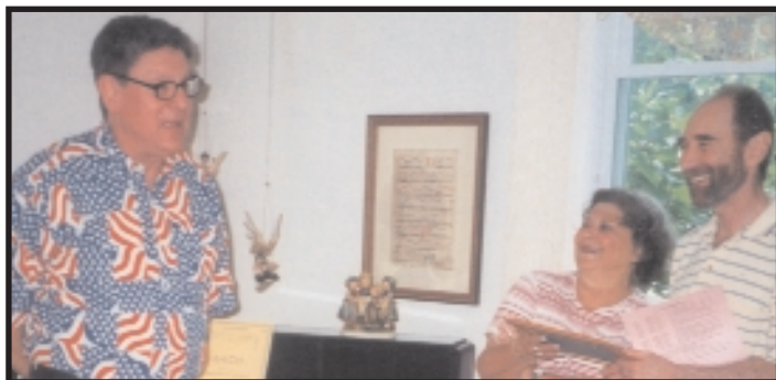
July 4 — Barbecue