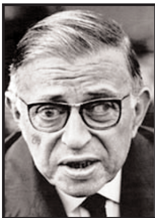
JEAN-PAUL SARTRE, ATHEIST

After the demonstration we will meet for a critique.